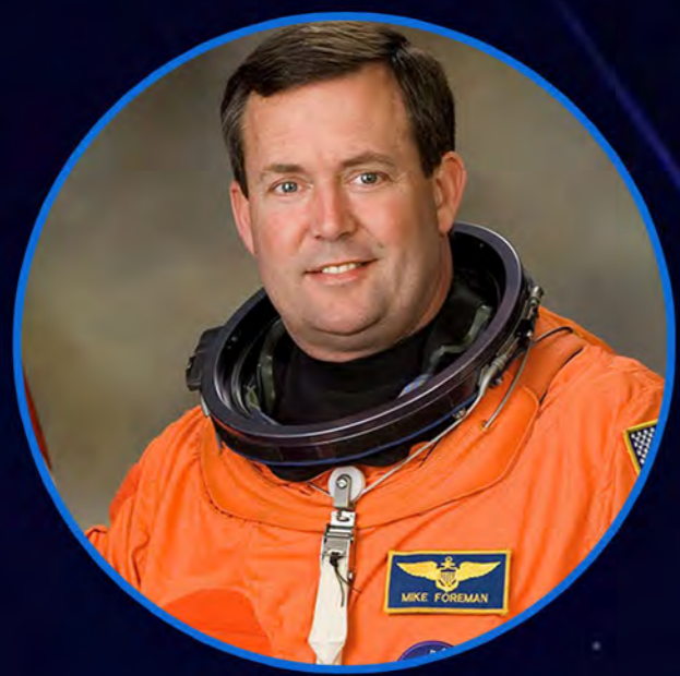
THE ASTRONAUT MIKE FOREMAN