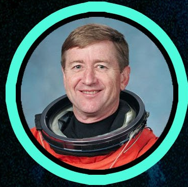
FRANK CULBERTSON ASTRONAUT (Retired) Captain, US Navy (Retired)

Captain Frank Culbertson (US Navy, Retired) flew as the pilot on STS-38 and the Commander of STS-51. He then served as the Shuttle-Mir Program Manager before flying to the International Space Station as the Commander of Expedition 3. Today, Culbertson serves as the President of the Space Systems Group at Orbital ATK. To learn more, visit www.AstronautFrankCulbertson.com .