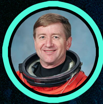
FRANK CULBERTSON ASTRONAUT (Retired) Captain, US Navy (Retired)

Captain Frank Culbertson (US Navy, Retired) flew as the pilot on STS-38 and the Commander of STS-51. He then served as the Shuttle-Mir Program Manager before flying to the International Space Station as the Commander of Expedition 3. Today, Culbertson serves as the President of the Space Systems Group at Orbital ATK. To learn more, visit www.AstronautFrankCulbertson.com .